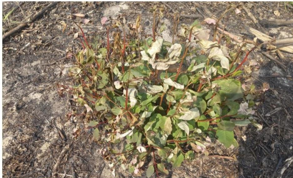
2 week old coppice